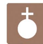
place of worship