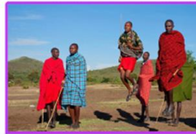
The Maasai have lots of customs and traditions, like the warrior jumping dance.