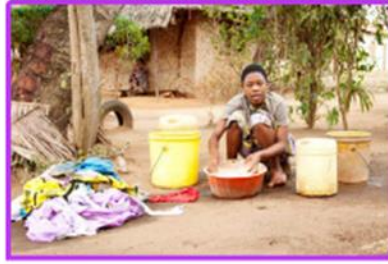
Most people in the countryside don't have cars, computers or TVs. Some don't have electricity.