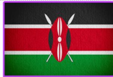
This is the Kenyan flag. Kenya has a president who runs the country.