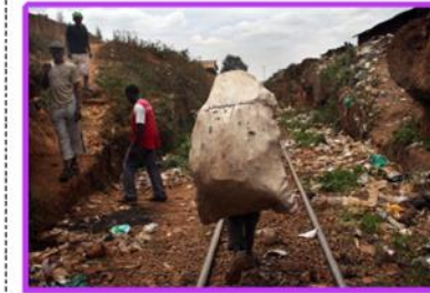
Many people are poor in Kenya, especially in the country.