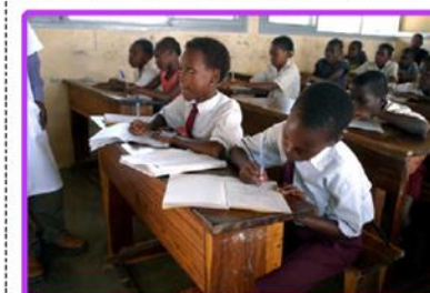
Children in Kenya learn reading, writing, maths and other subjects at school.

Write at up 5 things that are different about UK and Kenya.