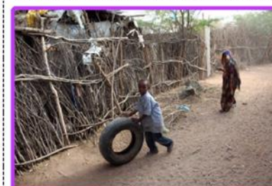
Some children in Kenya can't go to school because their families are too poor.