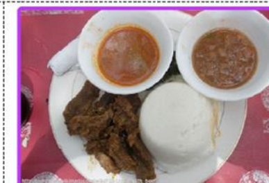
A popular Kenyan dish is ugali . This is a dish made of corn starch which is served with stew.