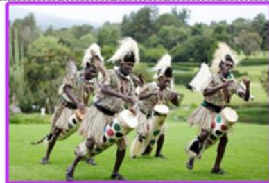
Kenyans like singing and dancing to lively music. They like playing lots of drums.

Write at up 5 things that are different about UK and Kenya.