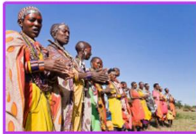
These people belong to the Maasai tribe. They live very traditional lifestyles.

Write at up 5 things that are the same about UK and Kenya.