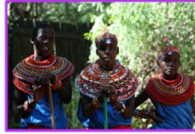
Both traditional and modern Kenyans love wearing colourful clothes and jewellery.