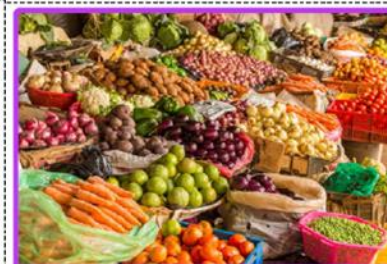
People eat a lot of foods like corn, vegetables and beans. Meat is expensive.