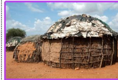
Many people live in small villages in the country. They live in mud huts.