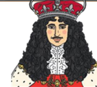
King Charles II