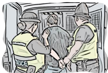
Modern day/ New Millenium