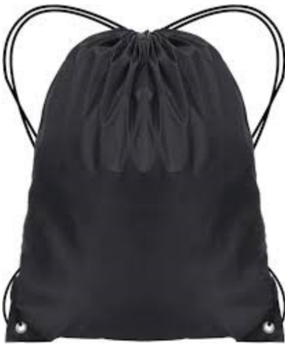
PE DRAWSTRING BAG

Thanking you all in advance for your support and have an amazing holiday period.